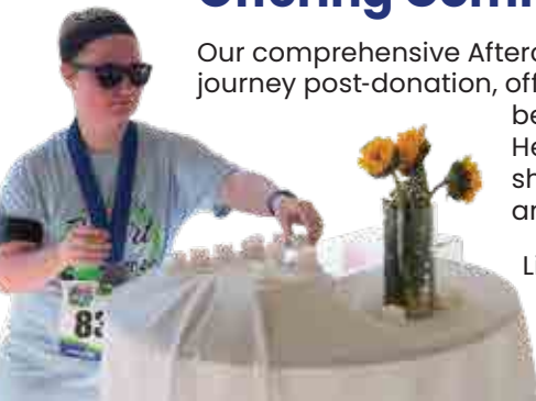
◀ Little Red Heart 5k participant lights a candle in honor of a 2024 donor hero.

LifeShare provides a variety of support services to families, including donation outcomes and grief materials. We facilitate correspondence between donor families and the recipients of their loved one's gift.